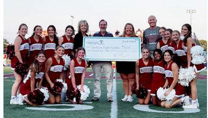
Danville Education Foundation Legacy Fund Grantee