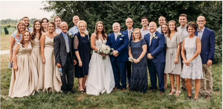
WHICKER FAMILY LEGACY FUND

We look forward to working with you to realize your charitable goals. Please contact us to get started today!