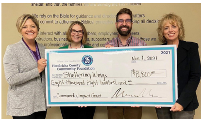
Sheltering Wings Legacy Fund Grantee