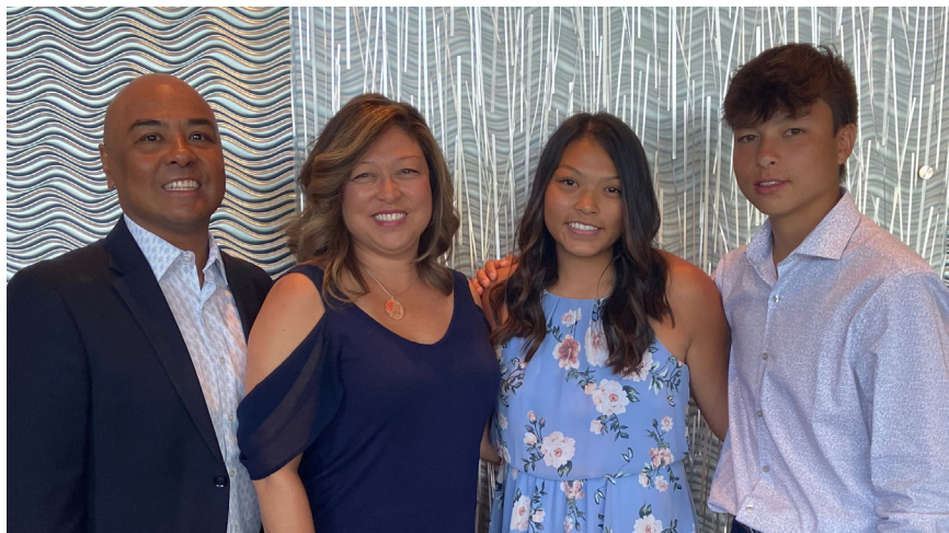
VILLANUEVA FAMILY LEGACY FUND