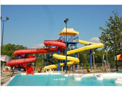
Gill Family Aquatic Center