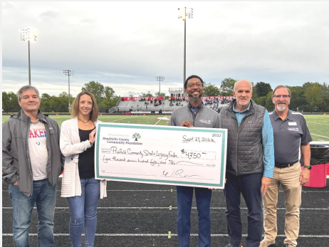
HCCF Staff present grant check to Plainfield Community Schools staff and Legacy Foundation members