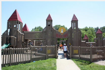
Blast Off Park, Brownsburg

You have one last chance this weekend, July 29-31, to see the Hendricks Civic Theatre's performances of The Hunchback of Notre Dame at Danville High School! Get your tickets at hendrickscivic.com today before they're gone!