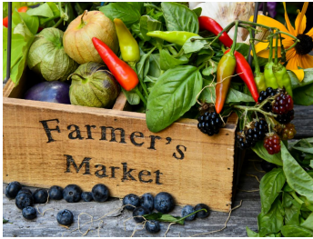
Produce at a Farmer's Market

As the weather gets warmer, we are loving getting outside and enjoying activities going on in the county! Here are your Community Foundation staff's favorite picks for happenings around the community: