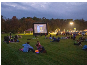
Movie Night in Brownsburg

Check out the event page here for more info.