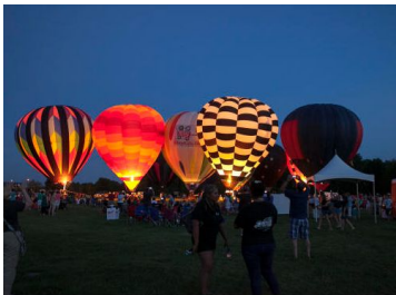
Hendricks County Rib Fest Balloons

The Hendricks County Alliance For Diversity is hosting the Hendricks County Pride Picnic at Williams Park in Brownsburg on Sunday, June 27 from noon- 5:00 pm. For more information, visit the event page here .