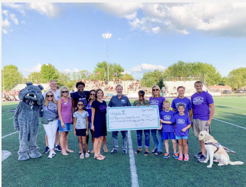
HCCF Staff present grant check to BEF members, school staff, students and the Brownsburg Bulldog mascot