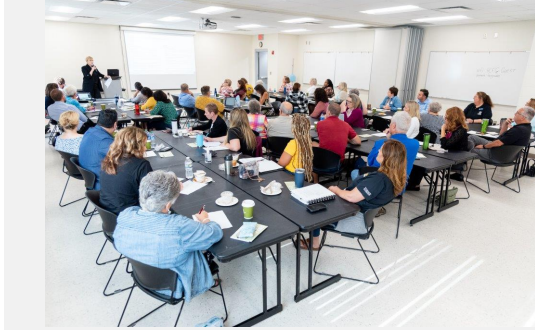
Building Better Boards, Session 1