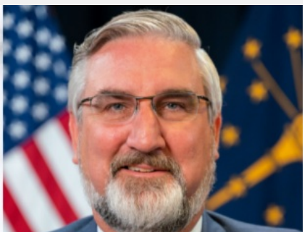
Governor Eric Holcomb

The Parks Foundation of Hendricks County is excited to host the 14th Summer Fun Run Series. If you love our parks and are up for an active summer challenge, you'll want to sign up! Click here for more information.