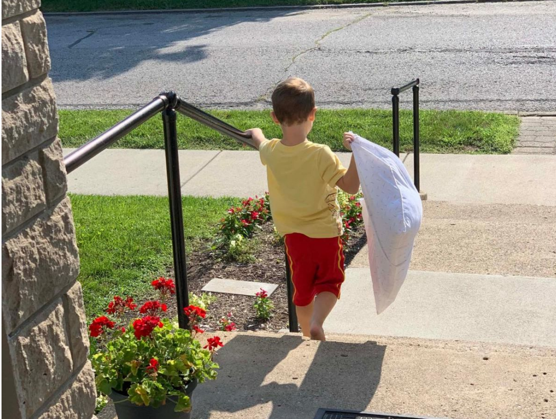
Family Promise family member on his way to his new home.

The Hendricks County Community Foundation partners with generous people to realize their charitable goals while addressing community needs in meaningful and lasting ways. The Community Foundation manages assets of over $14 million in a collection of funds created by individuals, families, businesses and organizations for charitable purposes. In 2018, the Community Foundation gave over $590,000 in grants to charitable organizations and scholarships to local students. For more information, call 317-268-6240 or visit www.hendrickscountycf.org .