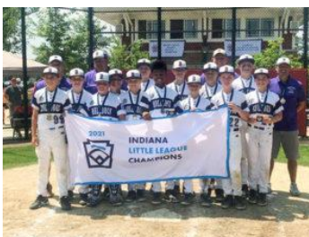
Brownsburg Little League

#2: Danville's Gallery on the Square hosted " Artists Paint the Town " a Plein Air Paint Out event on August 14. Artists from all over the state painted in historic Danville, Indiana. The artwork will be moved to the Gallery for a month, where it will be displayed and people can vote on the "People's Choice award."