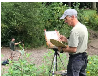
Artist in Danville

#1: North Salem Old Fashioned Days are almost here! Old Fashioned Days is a three-day event from Sept. 4th - Sept 6th in northwest Hendricks County. There are activities for the whole family and lots of great food, fun and lively entertainment. Check it out here!