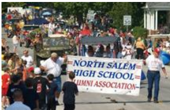
North Salem Old Fashioned Days

Summertime is finally here and its a great time to enjoy activities going on in the county! Here are your Community Foundation staff's favorite picks for happenings around the community: