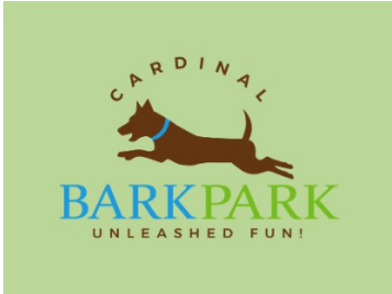
Cardinal Bark Park logo