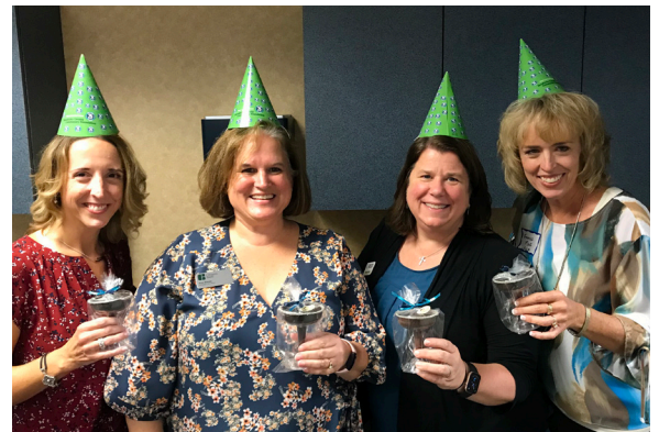
Anniversary Celebration at the Plainfield Chamber

Your generosity continues to impact our county through grants supporting our local nonprofits. Thank you for supporting HCCF for 25 years and join us as we work to better our community for the next 25 years!