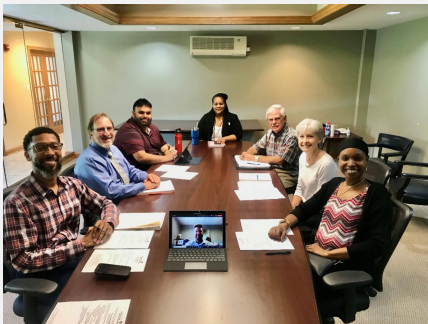
HCCF DEI Task Force

If you haven't taken the survey, please click here to take the survey and then SHARE THIS link - https://www.surveymonkey.com/r/2022_NeedsAssessment_QR - with your friends and family. Help us make Hendricks County a better place!