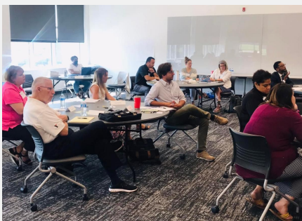
Steering Committee Meeting in July