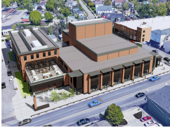
Artist's rendering of the new Plainfield Performing Arts Center

forward with construction of the Plainfield Performing and Fine Arts Center in Downtown Plainfield! The Performing and Fine Arts Center, which includes a 600-seat auditorium, will provide a new entertainment attraction in Plainfield. HCCF awarded a grant in 2018 to the Hendricks County Arts Council to help fund this project. Read more here .