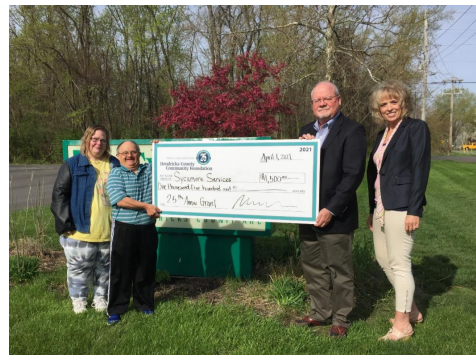
Grant check presentation to Sycamore Services