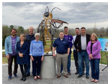
Unveiling of the new art exhibit at Williams Park

#1: Leadership Hendricks County is hosting their annual "Celebration of Leaders" event on May 13th. LHC works to develop effective and passionate leaders in Hendricks County. Learn more about their programming here .