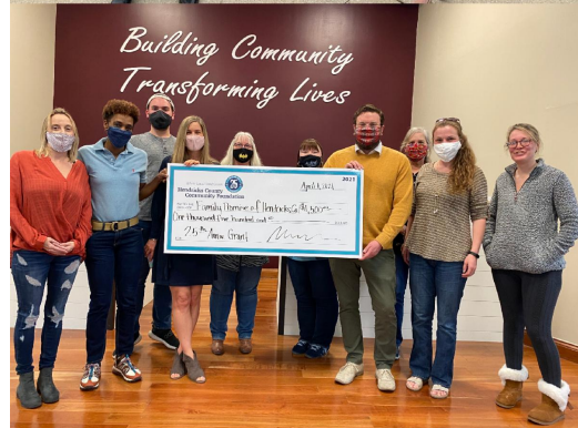
top: Grant presentation to Brownsburg Education Foundation; bottom: Grant presentation to Family Promise

Thank you BEF and Family Promise for your excellence in serving our community!