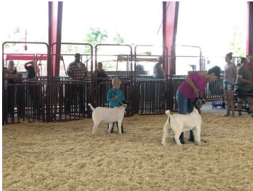
Hendricks County 4-H Fairgrounds

A Grand Opening ceremony will take place Wednesday, July 21, at 9 a.m. at the Bluegill Shelter near two large ponds totaling over 5 acres in size. It is free to attend, and the public is welcome.