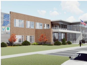
Made@Plainfield - artist's rendering

Summertime is finally here and its a great time to enjoy activities going on in the county! Here are your Community Foundation staff's favorite picks for happenings around the community: