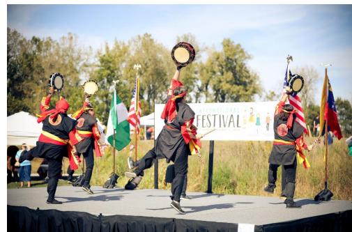
Performers at the International Festival 2019

HCCF is proud to sponsor the Second Annual Hendricks County International Festival! Enjoy this FREE, family-friendly, educational event in Plainfield on Saturday, October 2nd. There will be food trucks, live dance and music performances, interactive booths, traditional attire and more from these countries: India, Pakistan, West Africa, Poland, Russia, Mexico, Japan and Scotland.