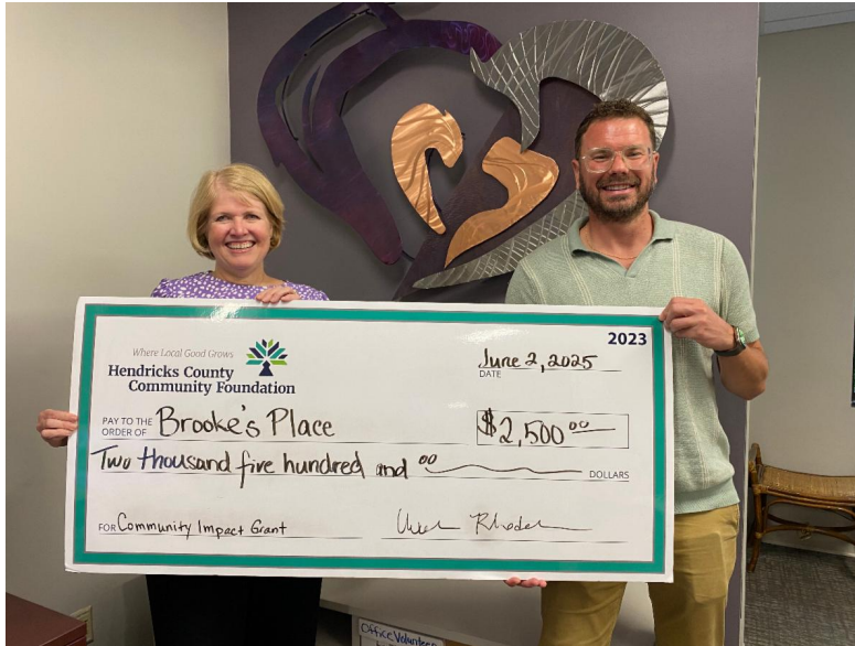
HCCF Community Impact Grant presentation to Brooke's Place

Click here to learn more and give to Stronger Together.