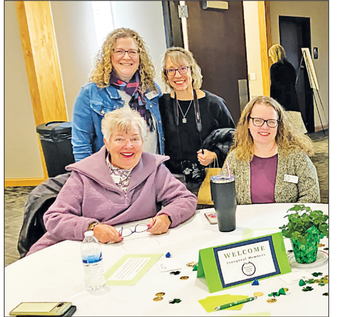
Members and guests enjoyed getting acquainted and networking during the Women's Giving Circle meeting, held in the Whipple Pavilion at Washington Township Park. A group photo of the current members of the Giving Circle was taken to record the historic event.

"I am excited for the opportunity to meet and work alongside other local women with a heart to fill needs close to home. This group seemed like a low commitment, high reward opportunity. Making small, significant changes locally is how things can improve on a much larger scale."