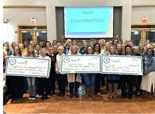
HCWGC Grant Award Night

Membership for 2026 is OPEN NOW! Join us in making a vital difference in Hendricks County. Join the Circle today!