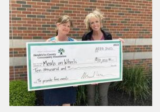
Grant presentation to Meals on Wheels Hendricks County

the County Council and Commissioners, created a <u>grant program</u> to distribute up to $6.6 million of American Rescue Plan Act funds allotted to Hendricks County. Last year, <u>HCCF distributed</u> over $548,000 in competitive grants to 25 local nonprofits.