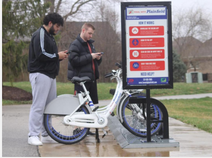
#PedalwithPlainfield bike program

trail and path systems. Learn more here .