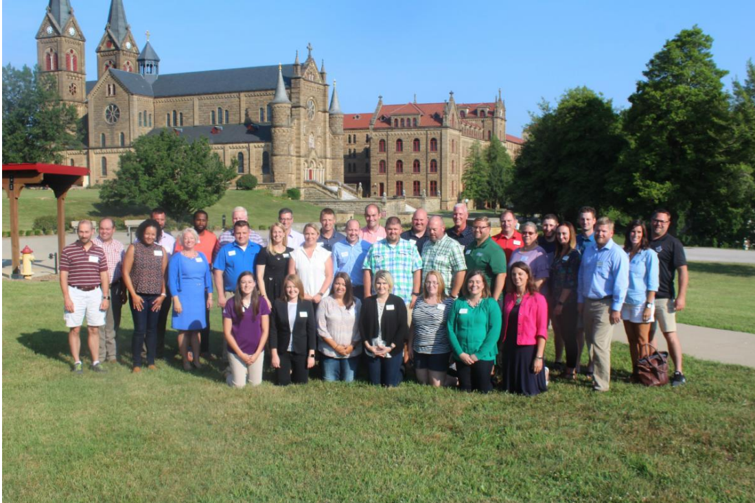
2021 AgrInstitute Class

The Hendricks County Community Foundation partners with generous people to realize their charitable goals while addressing community needs in meaningful and lasting ways. The Community Foundation manages assets of over $19 million in a collection of funds created by individuals, families, businesses and organizations for charitable purposes. In 2020, the Community Foundation gave over $1.6M in grants to charitable organizations and scholarships to local students. For more information, call 317-268-6240 or visit www.hendrickscountycf.org .