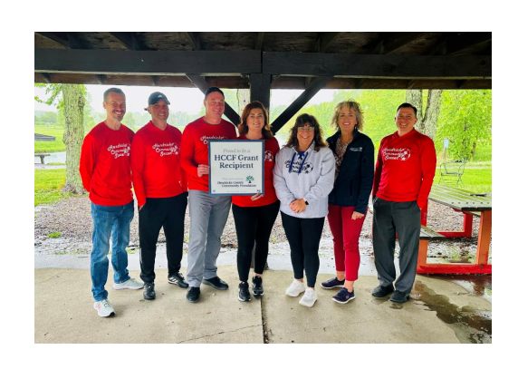
HCCF Grant presentation to Hendricks County Soccer

Here's a small sample of these impactful grants: