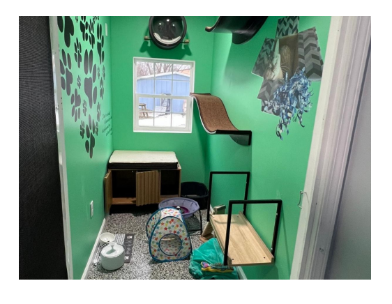
A kitty intake room at Kitty City

Donor Advised Funds at the Community Foundation allow donors the ability to support the causes and organizations they care about and be involved in the grant process. Contact us today to start your own Donor Advised Fund to make a a difference in our community!