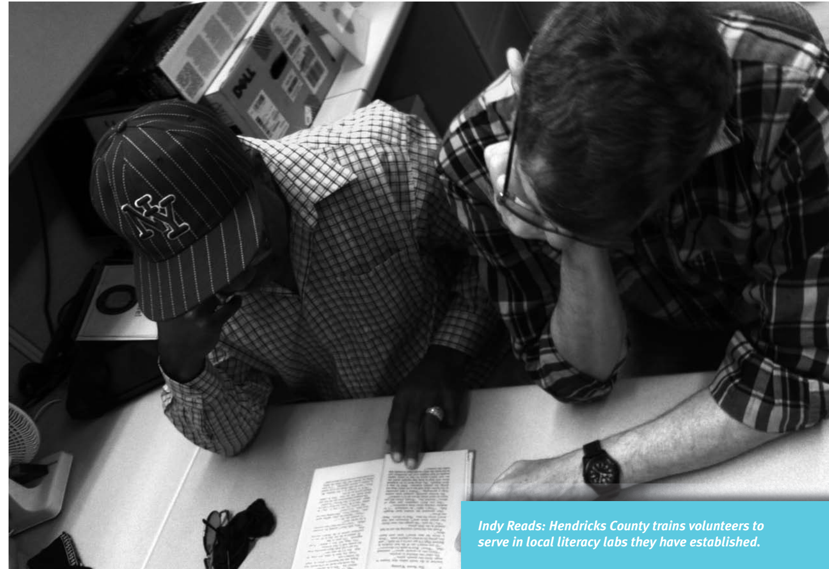
Indy Reads: Hendricks County trains volunteers to serve in local literacy labs they have established.

- Dr. Seuss, "I Can Read With My Eyes Shut!" -