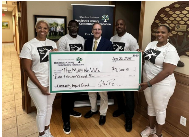
HCCF Community Impact Grant presentation to The Miles We Walk

Click here to learn more and give to Stronger Together.