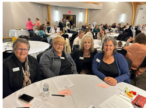
Members of the Giving Circle at a Grant Award Night

By pooling resources, this group provides local nonprofits the vital funding they need to help women and children right here in our backyard. Last year, this Circle awarded $45,000 in grants; this year, with 200 women voting and giving together, the reach will be even greater. Thank you for investing in our community's future and for proving that together we can do more!