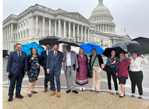
Foundations on the Hill attendees