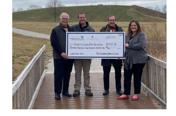
HCCF Grant presentation to Parks Foundation of HC

Support the causes you love! Start a Designated Fund and ensure annual support for your chosen organization. Contact us to learn how.