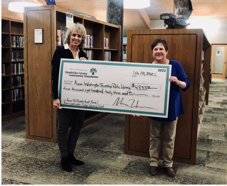
Designated grant awarded to the Avon-Washington Township Public Library