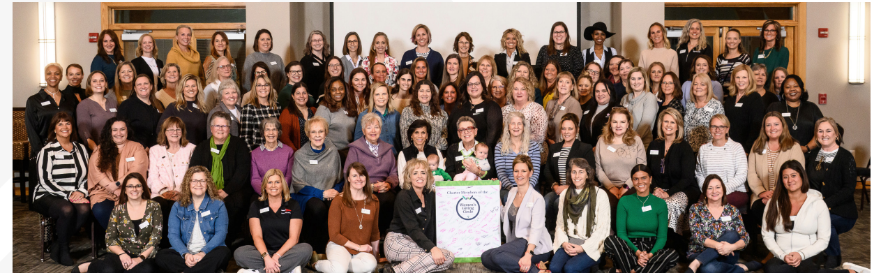
2025 MEMBERS OF THE WOMEN'S GIVING CIRCLE

In 2025, HCCF was proud to launch the very first giving circle in Hendricks County, bringing together a group of passionate women to pool their resources to meet needs in the community. The Hendricks County Women's Giving Circle (HCWGC) allows members to achieve a much larger impact than they ever could alone, turning individual gifts into significant support for our local nonprofits.