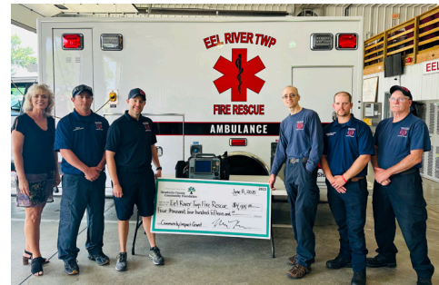
EEL RIVER TOWNSHIP FIRE RESCUE

Sheltering Wings Hendricks County Women's Giving Circle Fund - $3,800.00 Lincoln Bank Legacy Fund - $2,000.00 Sheltering Wings Fund - $2,984.00 Stronger Together Grantmaking Fund - $5,000.00 Shepherd's Pathway/Take Time and Pray Church Anonymous Donor Advised Fund - $720,850.14 (63 grants) Shepherd's Shelves (Pittsboro Christian Church) Hendricks County Food Pantry Coalition Fund - $2,600.00 Special Olympics Hendricks County Hendricks County Women's Giving Circle Fund - $7,500.00 St. Stephens Lutheran Church Hendricks County Food Pantry Coalition Fund - $2,000.00 Lincoln Bank Legacy Fund - $1,000.00 Stilesville Christian Church Hendricks County Food Pantry Coalition Fund - $2,600.00 Strides to Success Hendricks Power Cooperative Operation Round-Up Fund - $1,500.00 Stronger Together Grantmaking Fund - $5,000.00 Susie's Place - The Hendricks County Child Advocacy Center Lincoln Bank Legacy Fund - $2,000.00 Stronger Together Grantmaking Fund - $8,686.20 Sycamore Services, Inc. Hancel and Dorotha Owens Sycamore Services Day Program Fund - $2,699.00 Stronger Together Grantmaking Fund - $2,500.00 Sycamore Services/Hendricks County ARC Fund - $3,092.00