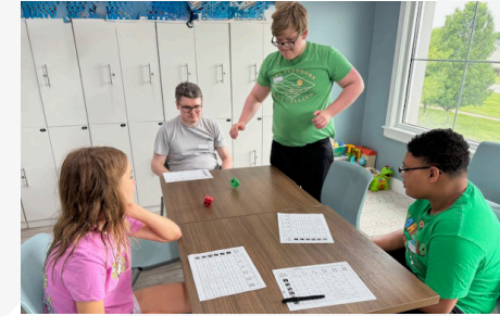
BUILDING ESSENTIAL SKILLS TOGETHER (BEST)

Town of North Salem North Salem Community Matching Grants Fund - $1,030.00 Young Professionals of Hendricks County XFUND - $1,114.23 (3 grants)