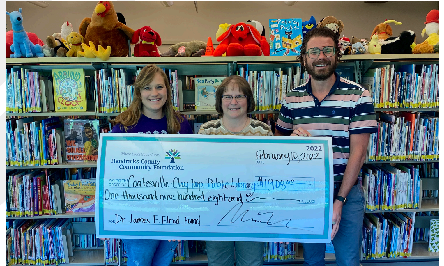
COATESVILLE-CLAY TOWNSHIP PUBLIC LIBRARY

Designated support keeps creativity alive through arts programming at Plainfield High School, and it enriches childhood learning at North Salem Elementary School,