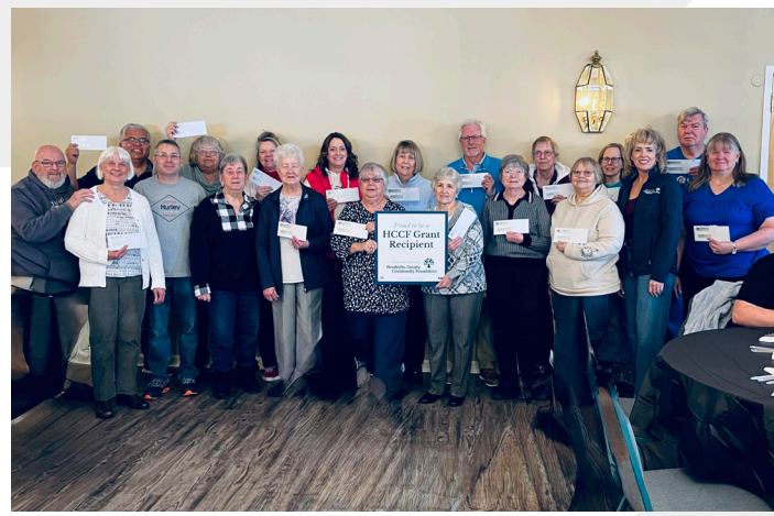
HENDRICKS COUNTY FOOD PANTRY COALITION

where classroom resources often need a boost. Donors also help protect vulnerable families: one fund sustains Sheltering Wings' children's programming, offering stability and care during times of crisis. And looking beyond county lines, another fund supports Riley Children's Hospital in Indianapolis, helping ensure exceptional medical care for kids across the region.