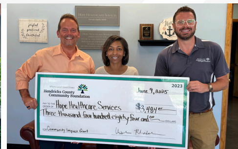
TOP LEFT: Hendricks County Community Schools; TOP RIGHT: Parks Foundation of Hendricks County; BOTTOM LEFT: Indiana Diaper Bank; BOTTOM CENTER: Jameson Camp; BOTTOM RIGHT: Hope Healthcare Services