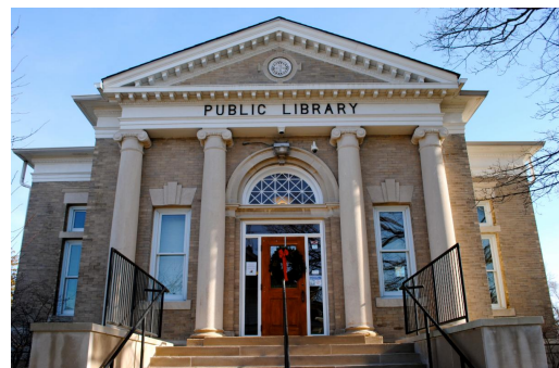
Danville-Center Township Public Library

This month the HCCF's Board of Directors approved Community Impact Grants, from our second cycle for the year, totaling over $86,507 to organizations serving every corner of Hendricks County. These grants were made from our largest unrestricted fund, the Deedee Daniel Opportunity Fund, as well as from 67 Family Legacy Funds created by families who want to leave a legacy for