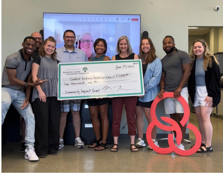
HCCF Community Impact Grant presentation to Central Indiana Youth For Christ